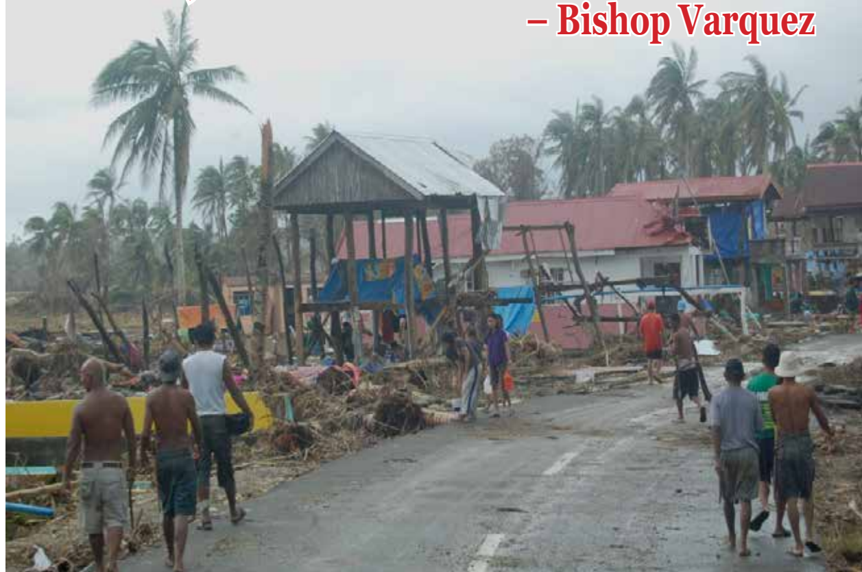
'Yolanda' survivors in Eastern Samar are still in the process of recovery and rehabilitation eight months after the typhoon.

A Catholic bishop denounced the practice of giving assistance to typhoon Yolanda victims in Eastern Samar supposedly in exchange for their faith, technically called "proselytizing".